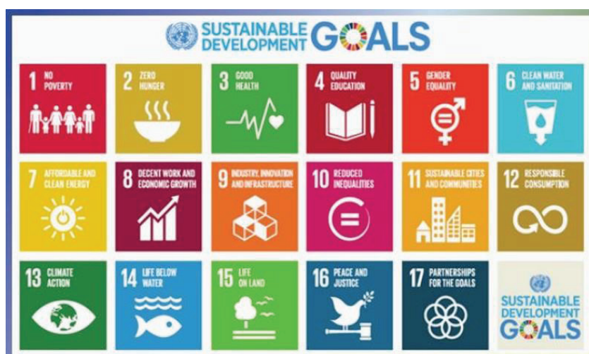
Figure 1: The United Nations Sustainable Development Goals.