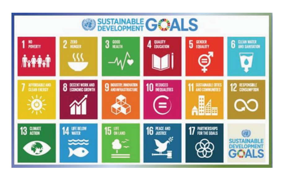
Figure 1: The United Nations Sustainable Development Goals.