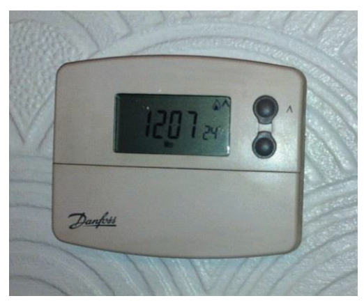
Figure 1(b). Thermostat control

In these cases, co-provision of energy services is not celebrated, but resisted, ignored or feared. This may reflect the social and demographic make-up of the sample of participants, and their position as tenants in social housing over which they may traditionally have held little sway. At the same time, they also reflect the process of installation and instruction that participants experienced, as suggested by