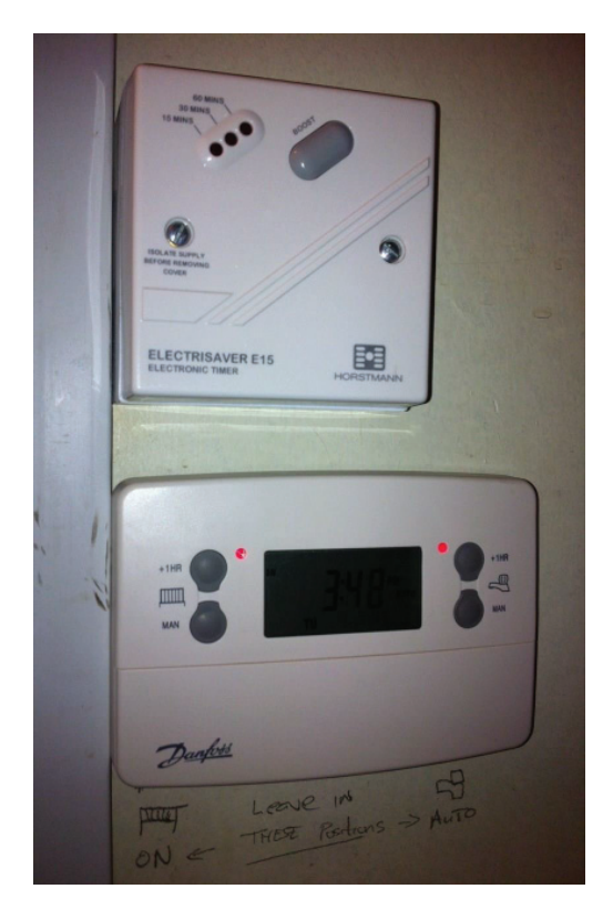
Figure 1(a). Hot water boost (top) and main control with handwritten instruction to leave in set positions (below)

For many, the demands of active participation in the provision of energy services seemed too great. Some had tried and failed to ensure that the ASWHP